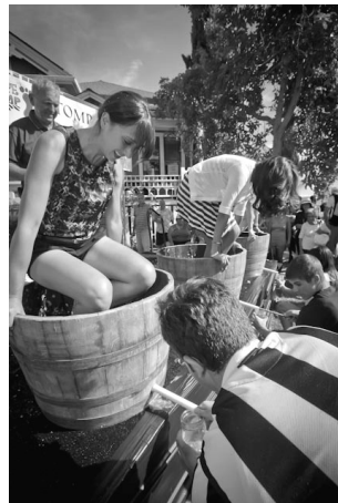
Grape Stomp competition at the 2013 Italian Family Festa

ence was very evident throughout the two days, and took on a collective family reunion. Given the times, and realities of our modern family structure, the Festa itself has become a focal point for friends and families to meet